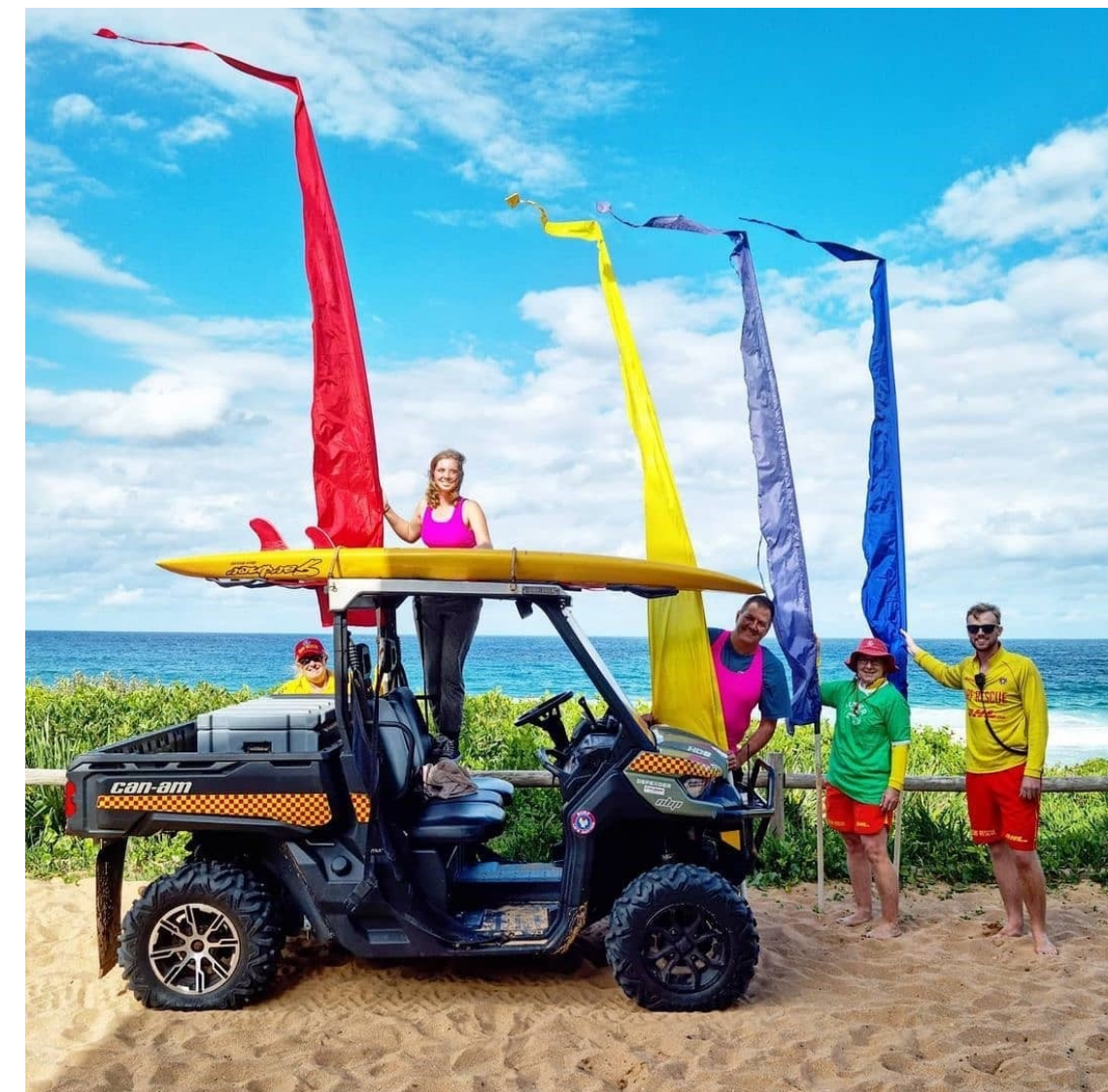
Flags & banners on your beach