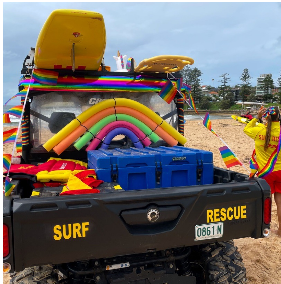
Add colour to your patrol kit & tent

Whatever you want to do on your beach to show that everyone is welcome.